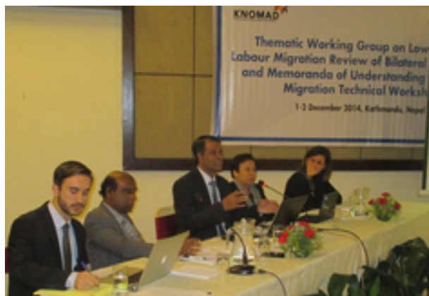
Photo: Session II speakers